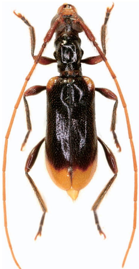
Fig. 1. Obrium miranda sp. nov., holotype ♀, from Phou Pan (Mt.), Houaphan Province of northeastern Laos.

with four long setae at apex; spermatheca distinctly sclerotized, long, almost U-shaped, with large gland which is constricted in basal part.